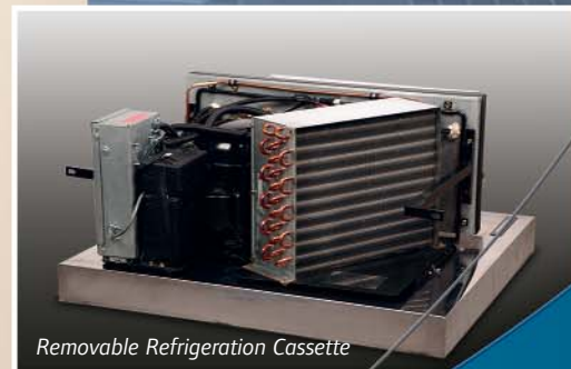
Removable Refrigeration Cassette