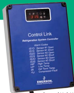
Control Link WIC P/N: 818-2510